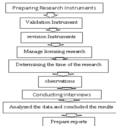
Figure 2. Procedures of Research

To test the validity of the data researchers used a technique precisely triangulation source. Triangulation techniques according to the terms Sugiyono resources (2016: 274) is a technique triangulasi. For credibility test data is done by checking of data obtained through several sources. Chart research procedures performed in this study: