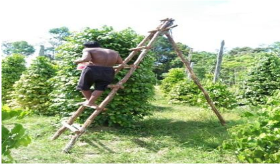
Figure 7. Tanga Pepper

Tanga pepper can be used as material Pythagorean Theorem and Trigonometry (Random Triangle area) because sugang on Tanga pepper can be arranged near and distance by foot tanga pepper so as to form a triangle arbitrary and the right-angled triangle between the legs tanga pepper, land, and sugang. However, for the use of tanga pepper in two such material only in the form of the matter because tanga pepper has a very large size.