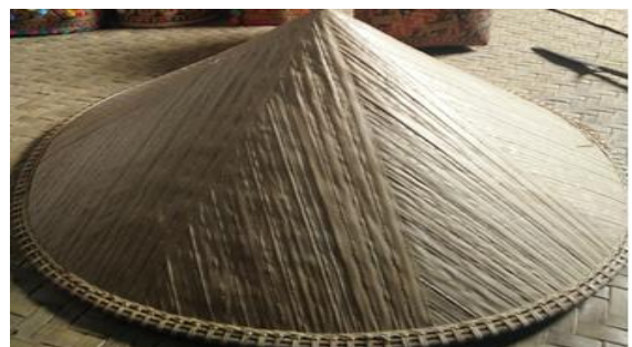
Figure 6. Tanggui