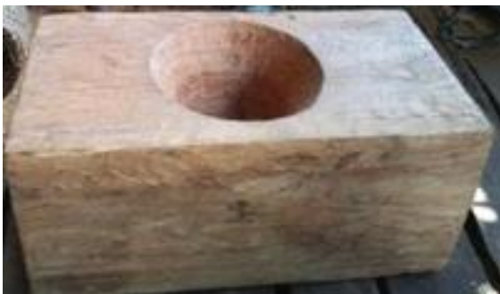
Figure 3. Lesung

Lesung can be used as props in the material that is geometrical geometrical and geometrical cone beam. To menghitung dimple volume can be used formula reduced volume Cone beam volumes.