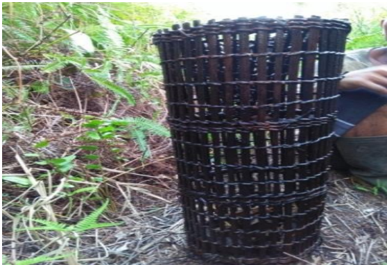
Figure 8. Bubu

Tanga pepper can be used as material Pythagorean Theorem and Trigonometry (Random Triangle area) because sugang on Tanga pepper can be arranged near and distance by foot tanga pepper so as to form a triangle arbitrary and the right-angled triangle between the legs tanga pepper, land, and sugang. However, for the use of tanga pepper in two such material only in the form of the matter because tanga pepper has a very large size.