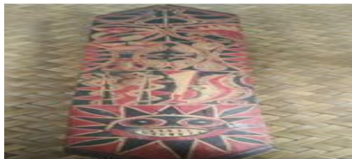
Figure 12. Terabai

Terabai can be used in the material compared to the use of terabai, use terapai on material comparisons can be used in the form of matter and materials Flat is Flat isosceles trapezoid, terabai on the material flat wake can be used as props to explain the flat wake contained in terabai and ask students to analyze and measure it using the formula terabai is widely terabai formula equals the area of a trapezoid with isosceles multiplied by two and a circumference equal to the circumference terabai isosceles trapezoid multiplied by two and subtracting the longest ribs. Terabai can be used as material fractions is in the process of use terabai, terabai use the material fractions in the form of application problems.