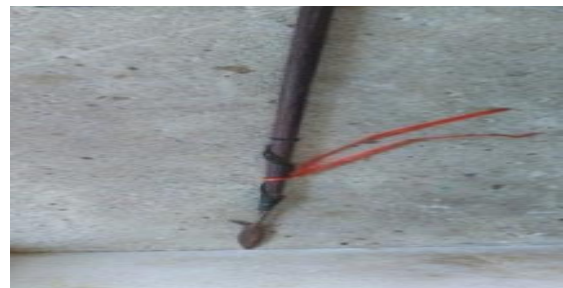
Figure 10. Sangkuh Akai Aduh

Akai Sangkuh aduh can be used on any material with a triangle trigonometry and elevation angle, use the dalam materi adoh sangkuh akai based usability of the tool. but the use of sangkuh akai ouch on the matter only in the form of application problems.