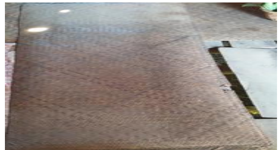
Figure 5. Kelayak

Kelayak can be used on flat wake rectangular material, where the use of Kelayak can be used as props and also about the application of the rectangular flat wake matter, therefore, the formula to calculate the area and perimeter Kelayak same with formula calculates of the area of a rectangle and rectangular circumference.