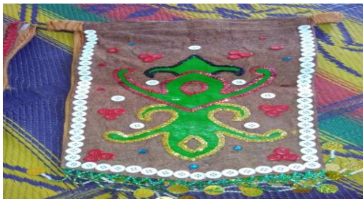
Figure 13. Sirat

Sirat can be used in the material flat wake of a combined two right-angled trapezium. Flat Sirat on the material can be used as props to explain the flat wake contained in the mesh and ask students to analyze and measure the area and perimeter mesh. Sirat same circumference dengang twice around the trapezoidal bracket reduced longest ribs and wide mesh coincides with the two right-angled trapezoidal areas and circumference equal with around two trapezoidal bracket congruent reduced longest ribs.