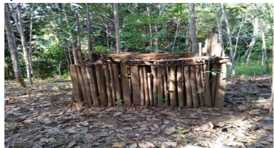
Figure 11. Tinja' Jelu

Akai Sangkuh aduh can be used on any material with a triangle trigonometry and elevation angle, use the dalam materi adoh sangkuh akai based usability of the tool. but the use of sangkuh akai ouch on the matter only in the form of application problems.