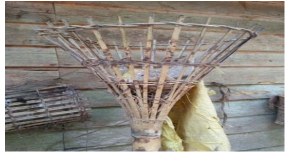
Figure 9. Entayak

Entayak can be used as materials wake chamber of tube and cones, use geometrical entayak in the material can be used as props to explain the geometrical concepts contained in the entayak namely geometrical tube and truncated cone. For fractional entayak material can be applied in the form of the matter because it relates to the manufacturing process entayak.