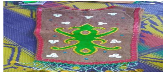
Figure 14. Baju Temeran

Temeran clothes can be used in the material number and flat wake patterns. The concept of the number pattern that is constant in the motif sequence that forms an array of beads and white dots (ex: 3, 3, 3, 3, ...). Concepts of Flat which is two isosceles trapezoid and a circle. Temeran clothes on the material flat wake can be used as props to explain mathematical concepts contained in temeran shirt which is a combination of two isosceles trapezoids and a circle, as well as asking students to analyze and measure the area and perimeter dress shirt temeran. Areas of temeran clothes equal with twice the area of an isosceles trapezoid reduced to the formula area of a circle and the circumference clothes temeran equal with around twice the circumference trapezoidal ribs isosceles reduced longest.