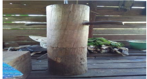
Figure 4. Kisar

Kisar can be used on materials wake tube space, where the use of Kisar on geometrical tube material can be in the form of application of the matter because it forms a large and difficult Kisar brought into the classroom so Kisar only is used in calculating the volume Kisar. For application can use the formula tube whereas for Kisar surface area can use the bare tube surface area and equal to the volume Kisar Close. Volume tubes and Kisar surface. Kisar circumference of a circle equals its height multiplied.